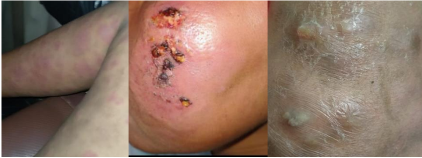
Figure 1 lesions on the extremities and face

The biopsy results showed a microscopic picture consistent with Hansen's morbus LL. On ultrasound examination, there were no cystic or myoma images. The patient has received therapy with clindamycin 2x300 mg, mefenamic acid 2x500 mg, Na fusidate cr 2% 2x1 in biopsy wounds, prednisone tab 1x40 gm in the morning after meals (week 1-2), lansoprazole 1x1, vitamin b complex 1x1, zinc 1x20 mg.